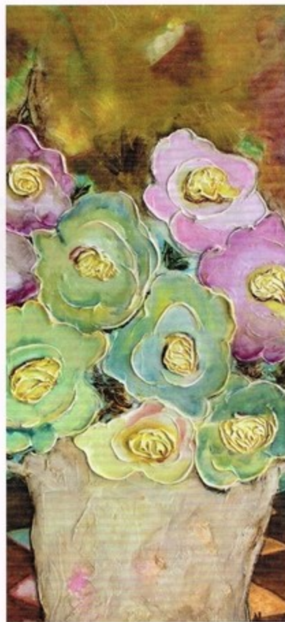
Citronade, acrylic on canvas, 12" x 24"