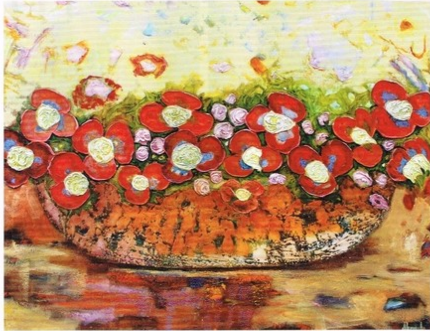
Red Red Red, acrylic on canvas, 35" x 46"

In 1990, her passion for painting became so